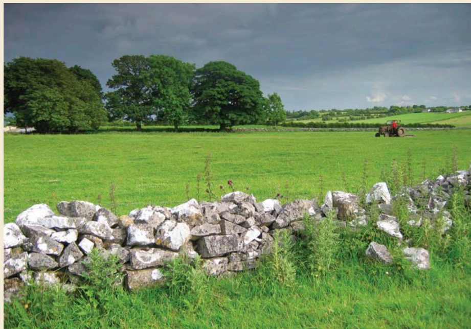
Ireland's land ownership system, in which tenants rented small plots from large landowners, encouraged dependence on a single, high-yield crop—the potato.

Following is an overview of the records where you'll start your Irish ancestral research. Keep in mind that while some Web sites link search results to record images, much of what you'll find online