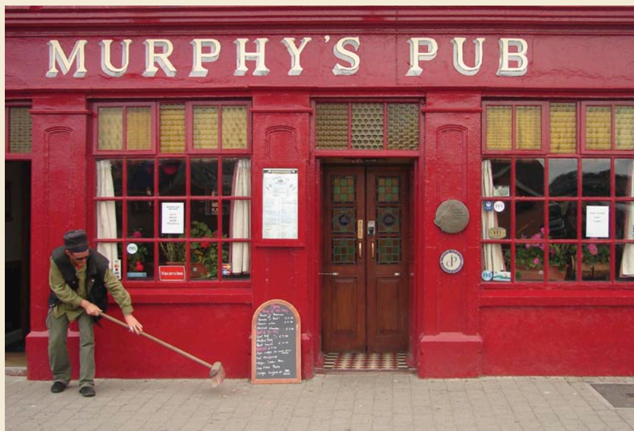
Some Ireland tourists say the best way to meet local residents is spending time in a local public house, or pub, such as this one in Dublin.